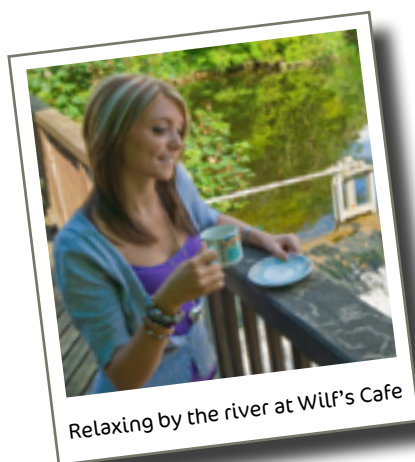
Relaxing by the river at Wilf's Cafe

In the Mill Yard, Wilf's café provide plenty of cycle racks and is a great place to rest and replenish. Enjoy the views of the river from the terrace. Wheelbase bike shop has everything a cyclist could need, and there are cycle racks outside here too.